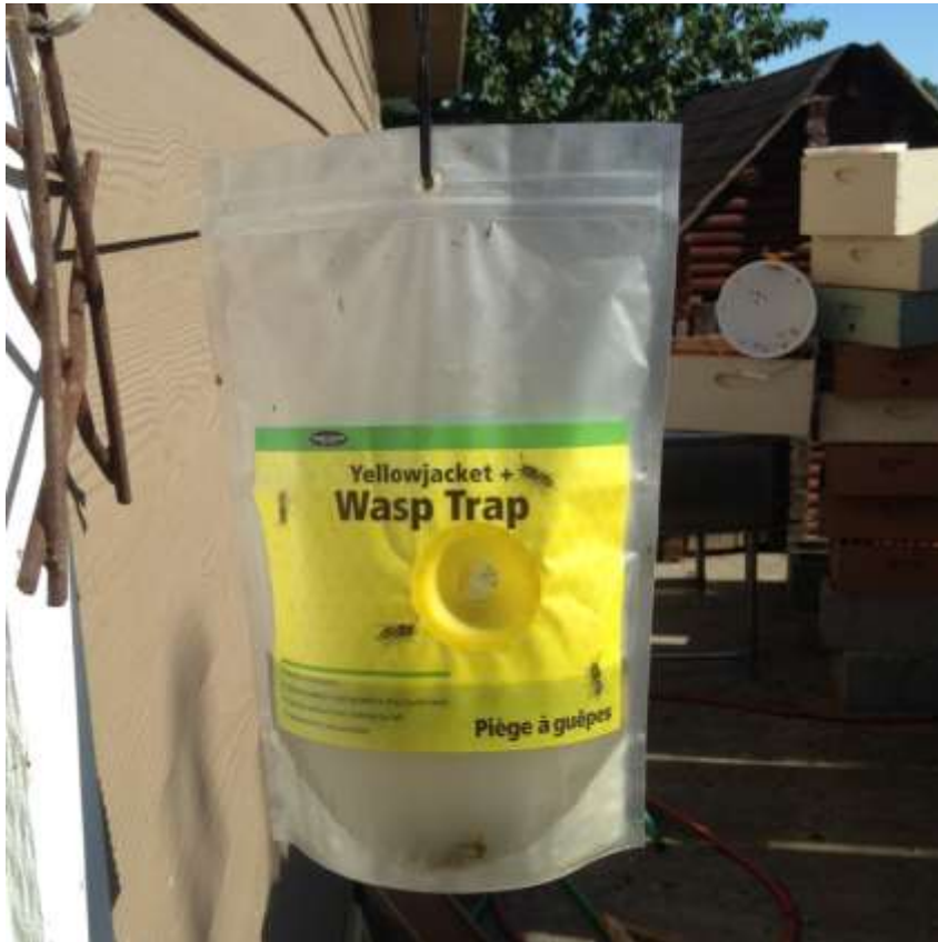
A Yellow Jacket trap