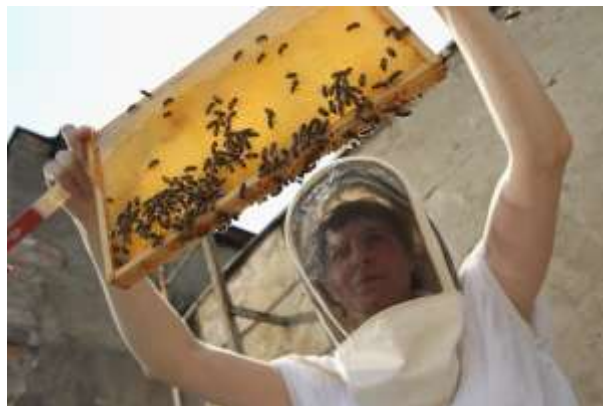
(Photo from the Open Source beehive project, © Sean Gallup/Getty Images)

To see a video that explains how the project works, visit: http://www.treehugger.com/clean-technology/smart-sensors-citizen-science-save-bees.html . To read more, visit: http://www.treehugger.com/clean-technology/smart-sensors-citizen-science-save-bees.html