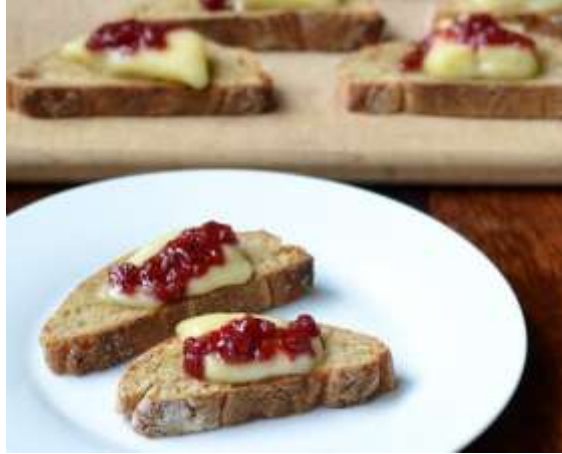
Honey Cups with Honey, Brie, Walnuts, and Cranberries